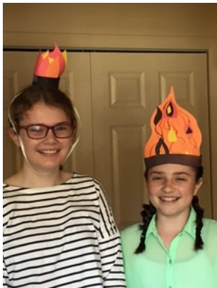
Some of our kids made flame hats for Pentecost!

Please join us as we end our school year, and enjoy ice cream and cookies after the service.